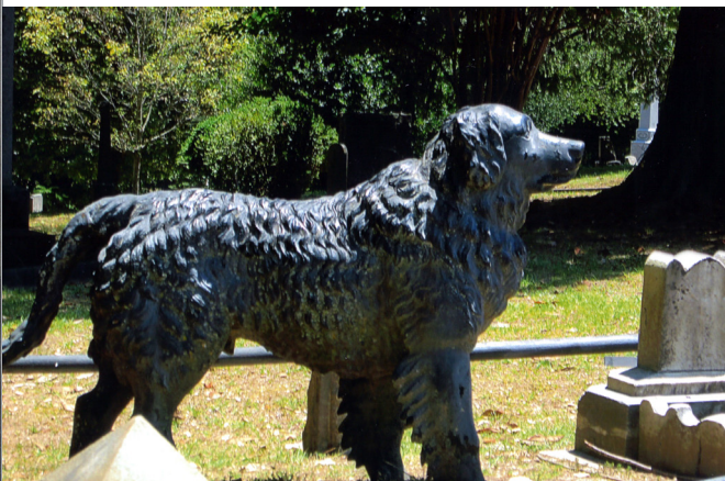
The Iron Dog