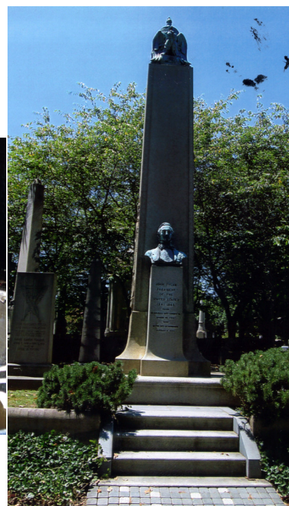
John Tyler burial site