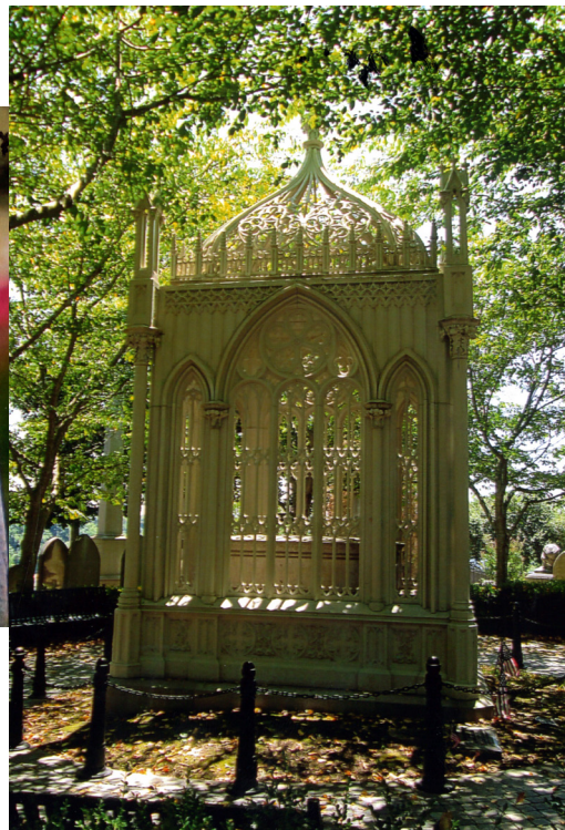
The "Bird Cage" of James Monroe