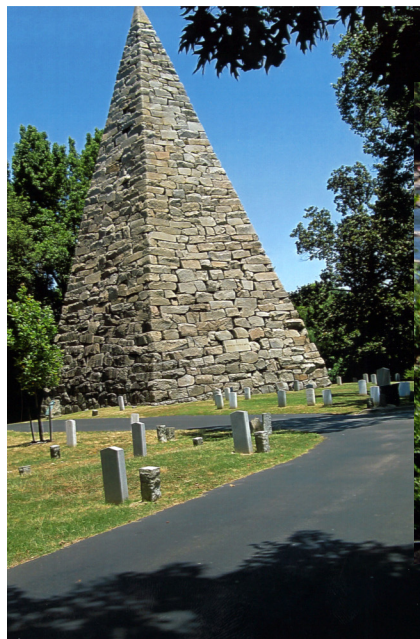
Tribute to the Confederate soldiers

Union military served: 2,213,363 Deaths 140,414