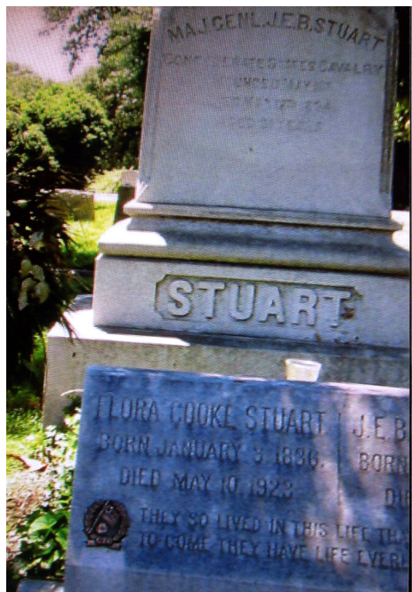
General JEB Stuart grave site