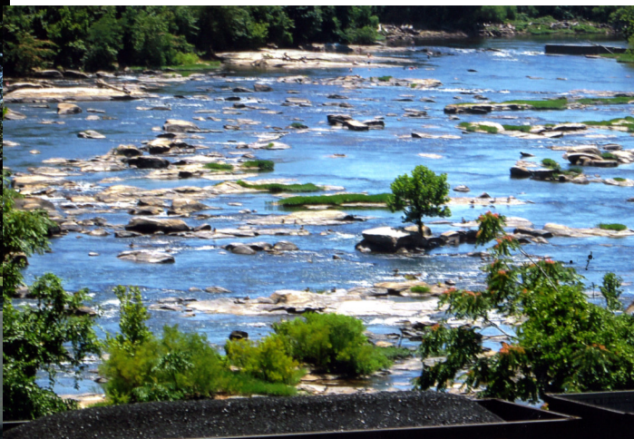
Scenic James River